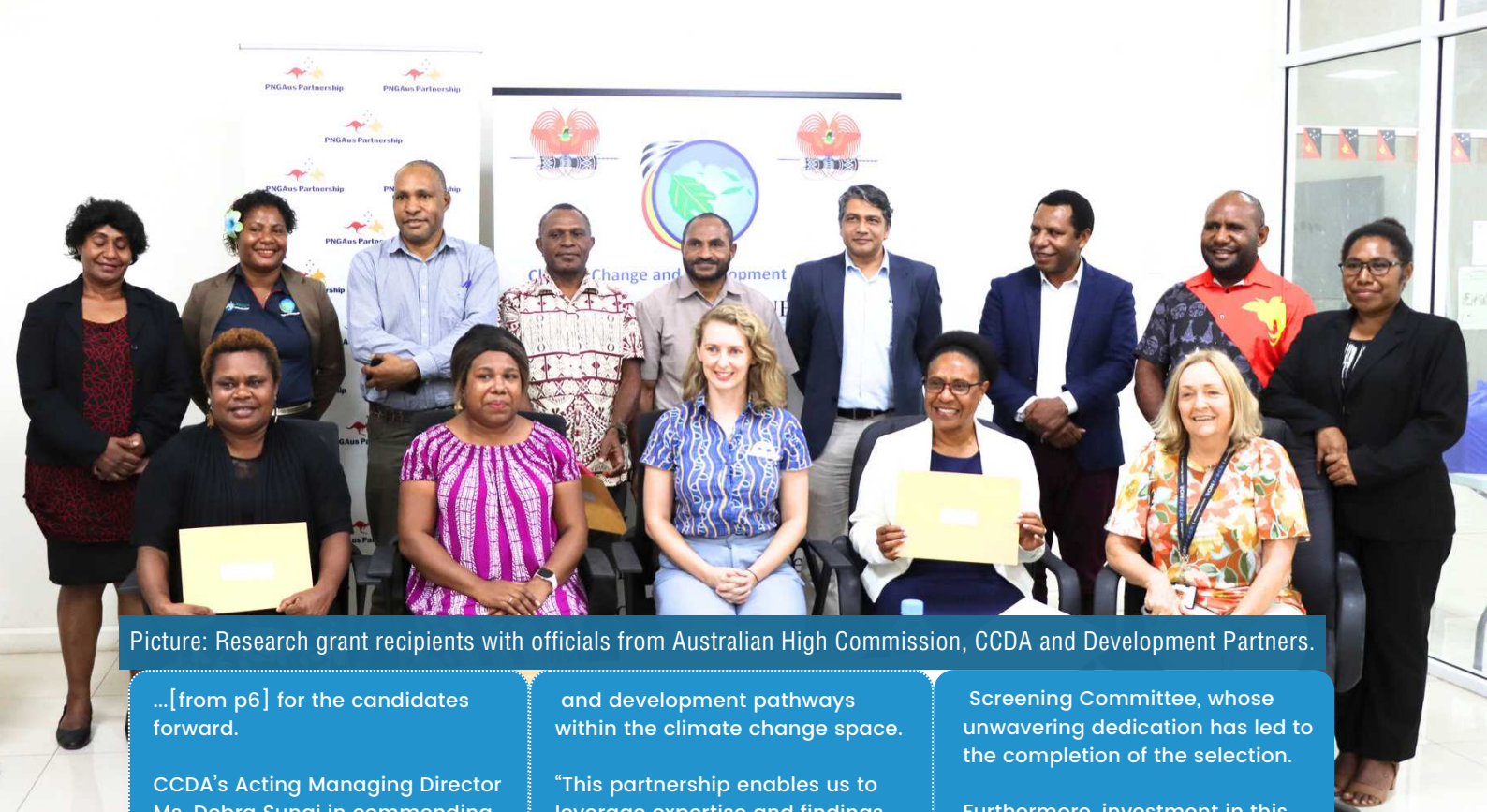
Picture: Research grant recipients with officials from Australian High Commission, CCDA and Development Partners.

...[from p6] for the candidates forward.