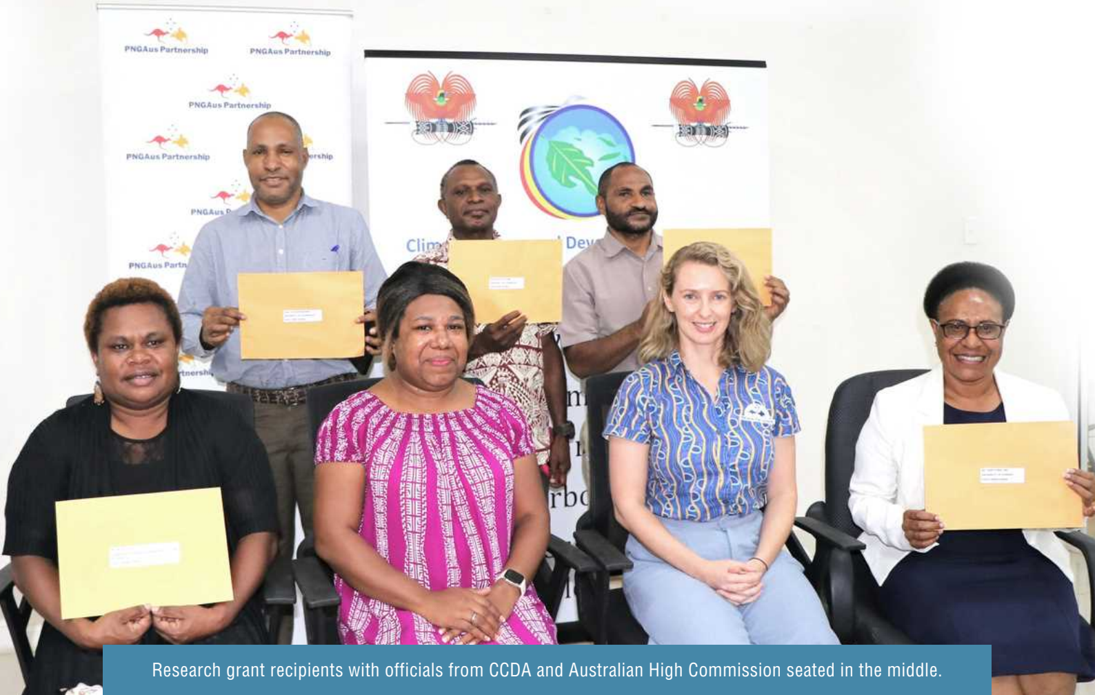
Research grant recipients with officials from CCDA and Australian High Commission seated in the middle.