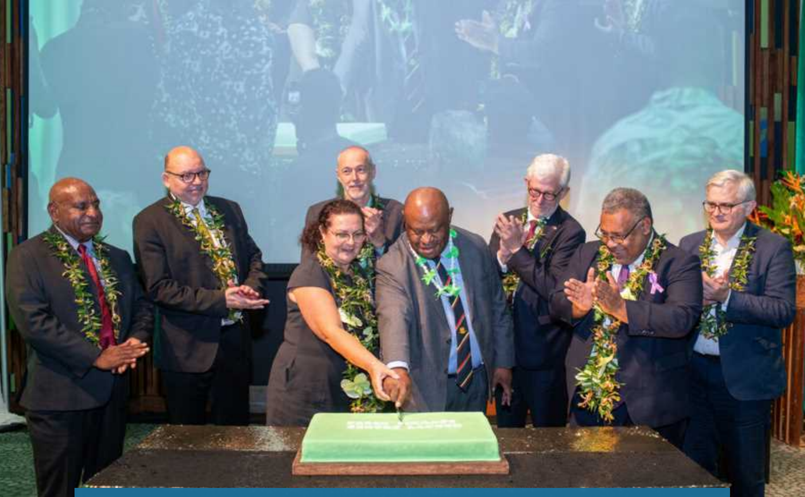
Picture above: Governor for Bank of Papua New Guinea Ms. Elizabeth Genia and Minister for Environment Conservation and Climate Change Honourable Simo Kilepa, cutting a cake in the presence of key dignitaries and guests to mark the launch.